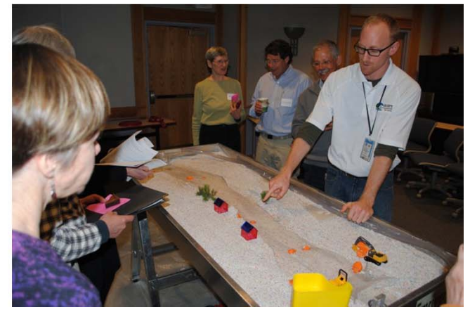
NH Geologic Survey staff demonstrate flooding impacts at a recent UVAW public forum