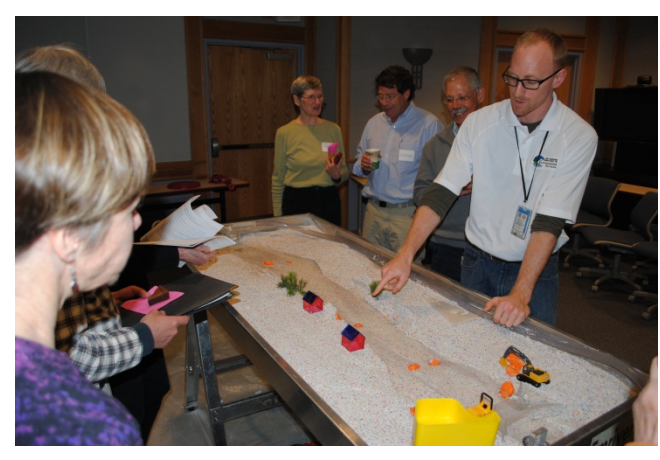
NH Geologic Survey staff demonstrate flooding Impacts at a UVAW public forum