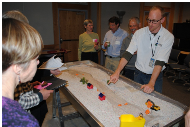
NH Geologic Survey staff demonstrate flooding Impacts at a UVAW public forum