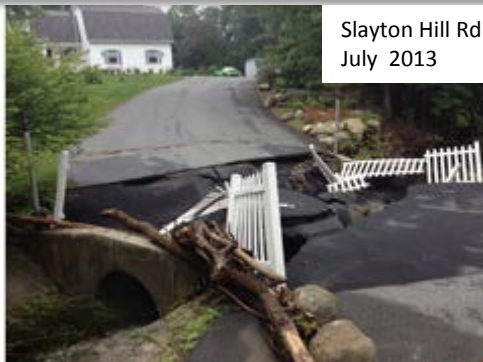
Slayton Hill Rd Lebanon, NH July 2013

Clean Air – Cool Planet. A Northeast-Focused Needs Assessment . 2011. http://cleanair-coolplanet.org/northeast-needs-assessment/