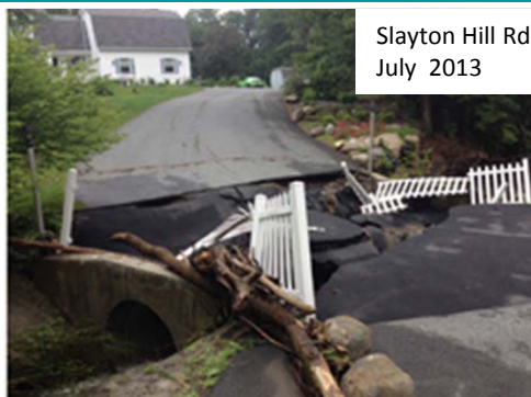
Slayton Hill Rd Lebanon, NH July 2013

Clean Air – Cool Planet. A Northeast-Focused Needs Assessment . 2011. < http://cleanair-coolplanet.org/northeast-needs-assessment/ >