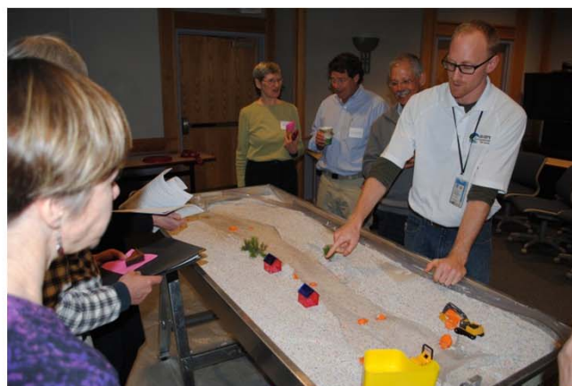
NH Geologic Survey staff demonstrate flooding impacts at a recent UVAW public forum